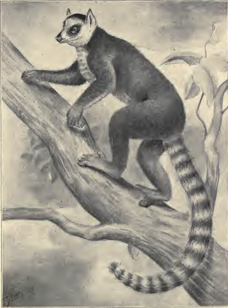
FIG. LXXVI. LEMUR CATTÆ. RING-TAILED LEMUR.